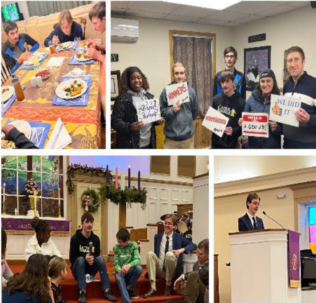
Learning about Zimbabwean culture through food and conversations, Leading worship Service, and having fun at the Escape Room!